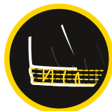
ELASTICATED CUFF AND WAISTBAND