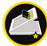
PERFECT FOR SCREEN PRINTING