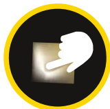
LUXURIOUS SOFT TOUCH FLEECE INNER