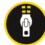
YKK ZIP LIFETIME WARRANTY